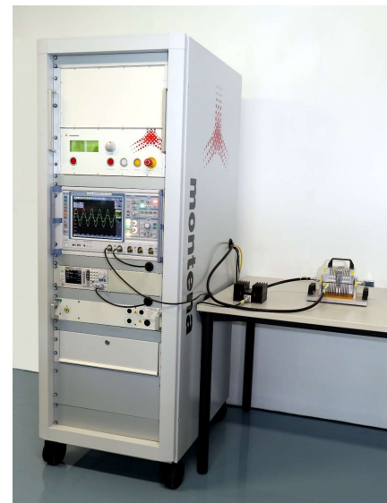
Examples of tabletop and rack-mounted solutions